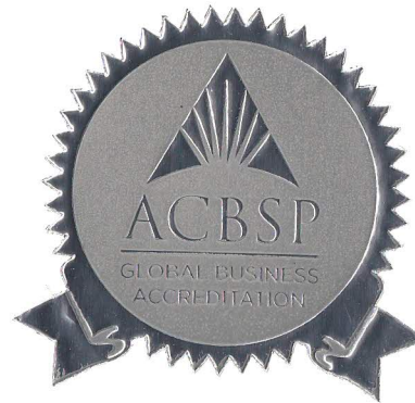
Director of Accreditation